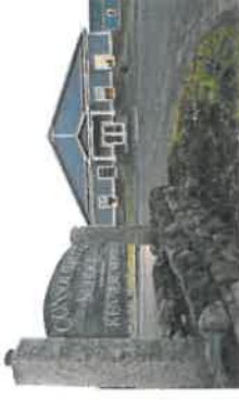
Kennebunkport Consolidated School