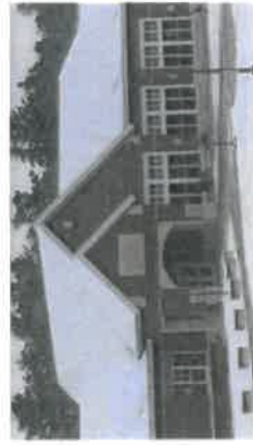
Kennebunk Elementary School