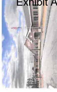
Mildred L. Day School