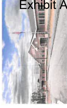
Mildred L. Day School