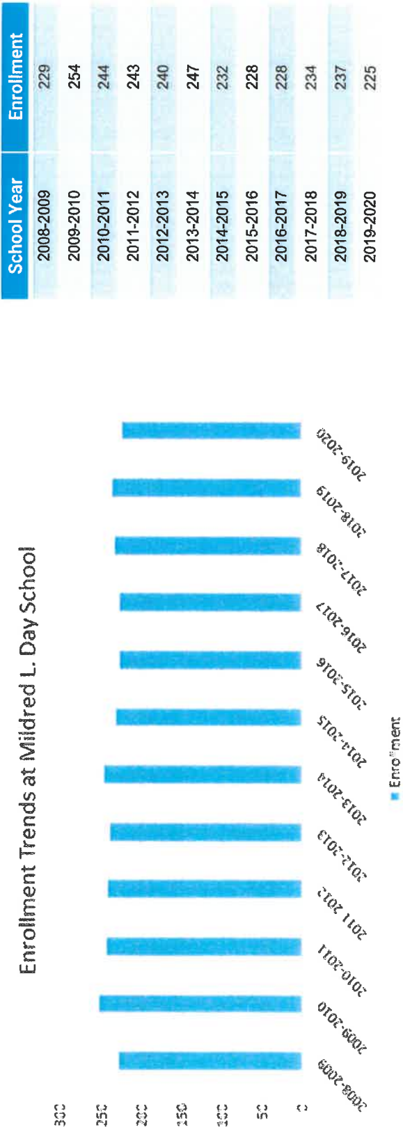
Exhibit A - 2-27-2020