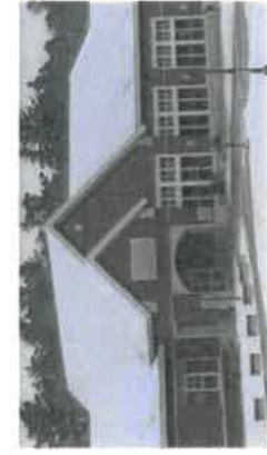
Kennebunk Elementary School