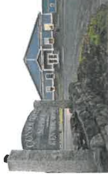
Kennebunkport Consolidated School