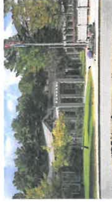
Sea Road School