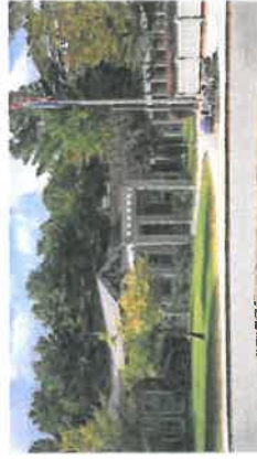
Sea Road School